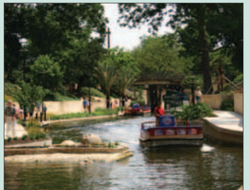
The River Walk Expansion links the downtown stretch to the San Antonio Museum of Art and the Pearl Brewery.

DISCLAIMER The City of San Antonio does not guarantee the accuracy, adequacy, completeness, or usefulness of any information. Individuals assume all risk and responsibility.