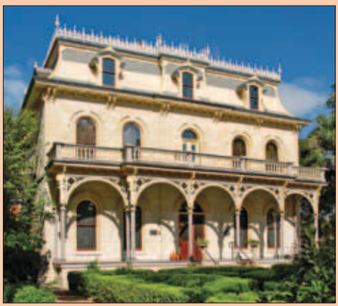
The Downtown/Southtown Route passes by the Stevs Homestead Museum, a three-story residence built in 1876.

Public restrooms can be found in Rivercenter Mall and La Villita Historic Arts Village.