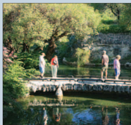
Brackenridge Park encompasses the Japanese Tea Gardens (above) and the San Antonio Zoo.

DISCLAIMER The City of San Antonio does not guarantee the accuracy, adequacy, completeness, or usefulness of any information. Individuals assume all risk and responsibility.