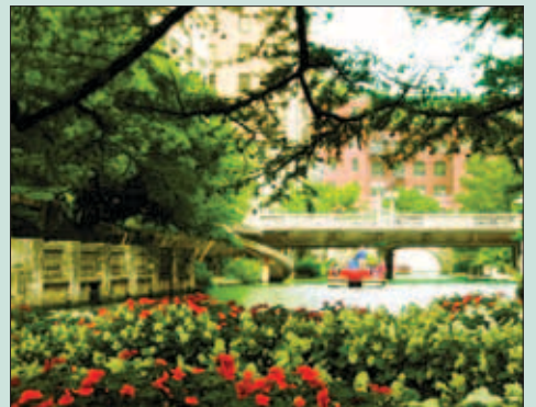
The River Walk winds along the San Antonio River downtown, one story below the bustling street level.