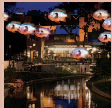
The new River Walk Museum Reach features native landscaping and dazzling public art.

DISCLAIMER The City of San Antonio does not guarantee the accuracy, adequacy, completeness, or usefulness of any information. Individuals assume all risk and responsibility.