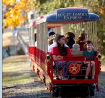
The San Antonio Zoo Eagle offers a nostalgic ride through Brackenridge Park.

Along the way, you'll find public restrooms at Rivercenter Mall and Brackenridge Park.