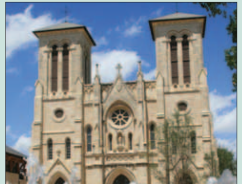
San Fernando Cathedral overlooks Main Plaza in the heart of downtown San Antonio.