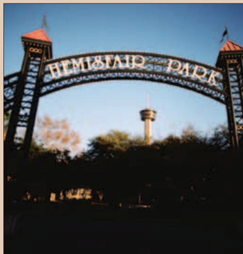
HemisFair Park was built to host the 1968 World's Fair and is home to the famous Tower of the Americas.

DISCLAIMER The City of San Antonio does not guarantee the accuracy, adequacy, completeness, or usefulness of any information. Individuals assume all risk and responsibility.