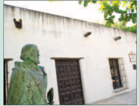
The Spanish Governor's Palace, reopened in 2010, once housed the officials of the Spanish Province of Texas.