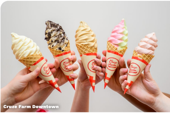
Cruze Farm Downtown