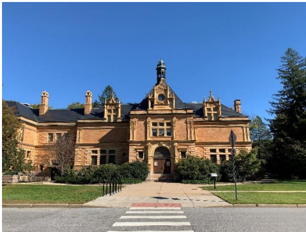
National History Museum and Planetarium, Providence RI

There is a lot to see! Walking to the Providence River from the Graduate Hotel , the Natural History Museum , Brown University, and of course the Convention Center , where the conference takes place. As one of the oldest cities in New England, it is historical, with many tour options .