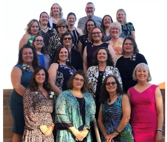
2024 Annual Session Ambassadors

We hope that you will join us! Watch for additional information and application materials coming soon!