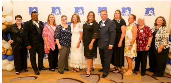
2024/2025 NEAFCS National Officers

For more information about each position and to access the application , visit the National Office Candidate Resource web page . If you have any questions, please contact the Nominating Committee Chair at rickgrif@nmsu.edu .