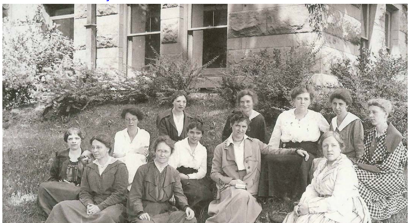
"The first home economists" on the Armsby Building lawn, University Park campus