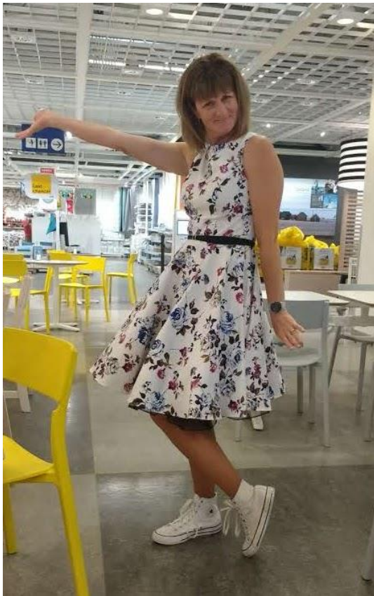
CEAFCS President – rockin' the 50's attire!