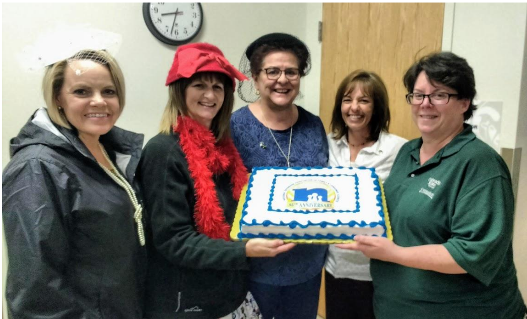
Colorado CEAFCO Officers