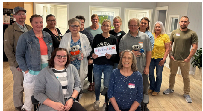
-Iowa's Mental Health First Aid program

"I was rear-ended at 50 MPH. My son was in the back seat and he wasn't injured. You are the reason he was in that seat. I'll never be able to repay you for that."